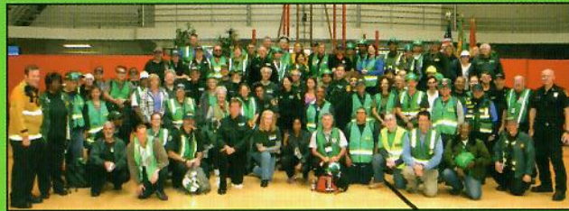
All classes taught by a Los Angeles Firefighter

Download the LAFD Emergency Preparedness Guide: cert-la.com/EmergPrepBooklet.pdf