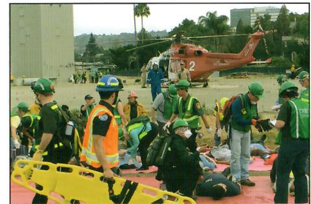
CERT training exercise/skills refresher

We invite you to attend this FREE All Hazards Training where you will learn some basic life-saving skills for the safety and protection of yourself, your family, and your neighborhood!