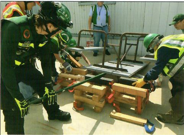
Cribbing drill - safe removal of victim

The class runs for 2½ hours, one day a week (morning, afternoon or evening) for seven weeks for a total of 17½ hours of training. All CERT Training is free and instructed by a Firefighter from the Los Angeles Fire Department.