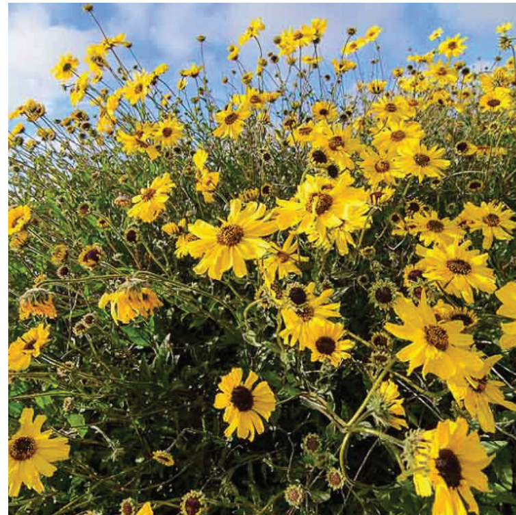
California Sunflower ( Encelia californica )

- For plants, LA CC is proposing Ca. native plants, which include: