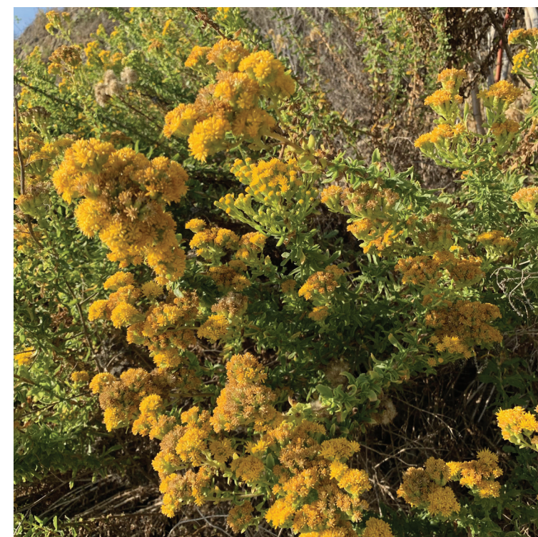
Menzies Goldenbush (sage Isocoma menziesii )