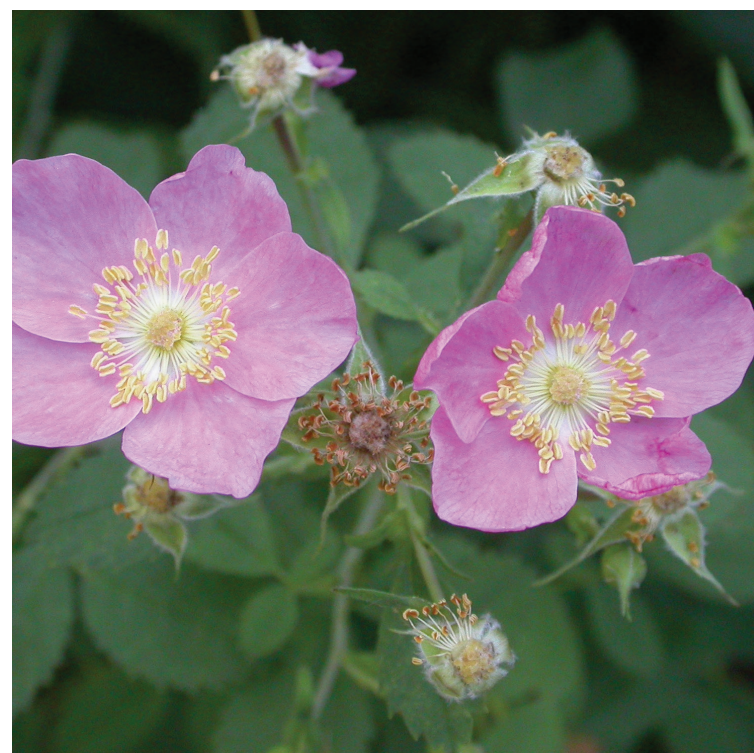
California wild rose ( rosa californica )