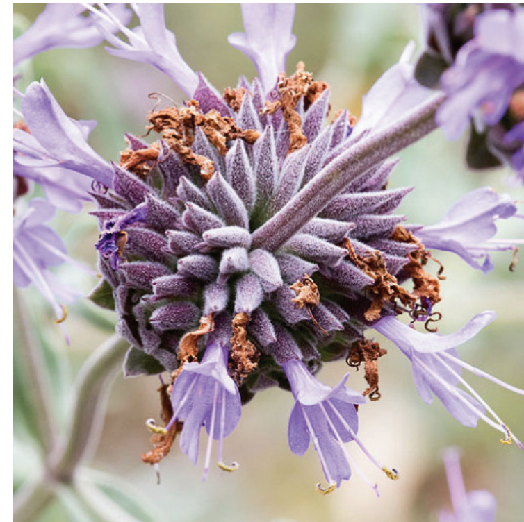
Cleveland Sage ( salvia clevelandii )