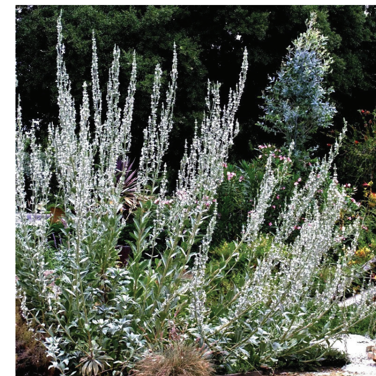
white sage ( salvia apiana )