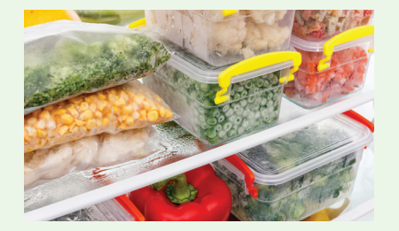
In the refrigerator The bottom of your fridge is the coldest and is good for meat and perishables; cooked foods should go on the middle shelf and the door is the warmest and is best for condiments.

In the freezer Frozen food will keep longer. Portion it out, label and date your food so it is easy to serve later. Wrap, label and date everything. Rotate food so you use older items first.