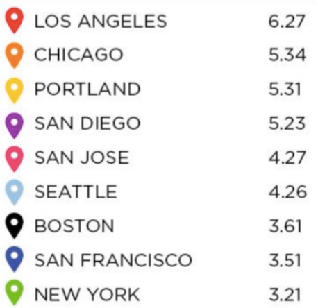
Source: National Highway Traffic Safety Administration; 2012 Calendar Year