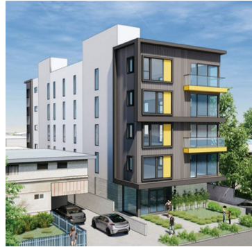
New development planned for 12759 W. Caswell Ave.

During the July to December 2021 interval, new planning submissions were few, but since the start of 2022 that volume has increased. The committee voted to oppose a new development in Zone 7 on Caswell Ave. despite this development being by-right. The committee is expected to hear additional presentations in the near future, particularly from developers interested in building in Zone 7.